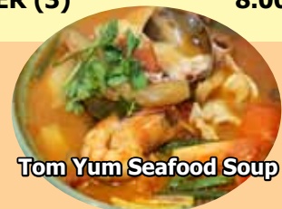
Tom Yum Seafood Soup