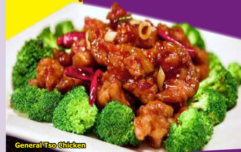
General Tso Chicken