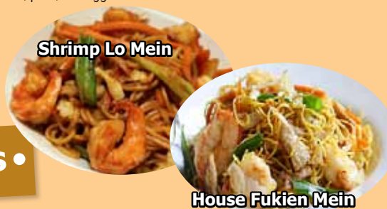
Shrimp Lo Mein