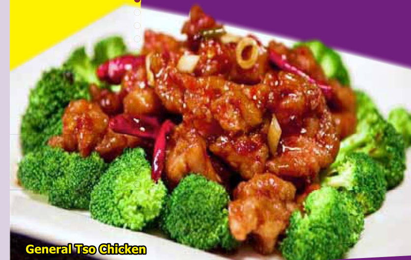
General Tso Chicken